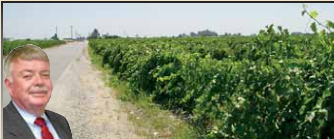
INCOME OPPORTUNITY $410,000

23+ acres with Thompson Seedless grapes. Good water, good production, and in a good location. Fresno Irrigation water, and less than 10 miles from town. Production records are available. Commercial across the street. Traditional sale. Presented by Raymond Schmall