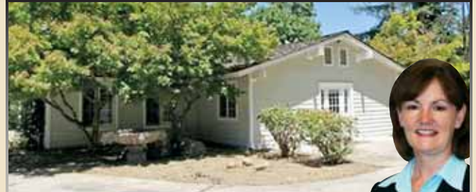
2.3+ ACRES IN CLOVIS $415,000

5BR, 3BA, 3325± sq.ft. home needs TLC to restore original glory. Great room, dining room, hardwood floors, & kitchen w/ granite counters. 2 separate wings, each with master suite. In-ground pool & cabana. Once-lush landscape has paths to koi pond, aviary. 2000+ sq.ft. guest house. Presented by Judy Overstreet