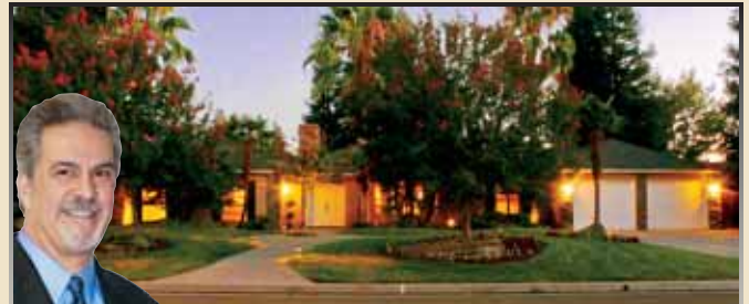
SUNNYSIDE PARK ESTATES $389,000

Truly custom 4BR, 2.5BA, 2533± sq.ft. with great curb appeal. Extra-large front & back yards with large covered patio. Recent top-of-the-line flooring, & interior paint. Formal DR & LR, den & kitchen/nook area. Spacious utility room & pantry. Ceiling fans, built-in cabinetry & tons of storage. Presented by Myron Emerzian