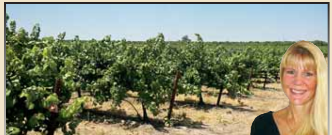
PERFECT FOR GENTLEMAN FARMER $385,000

Beautiful Rubi-red vineyard, vines only 17 years old with good production. Build your dream home on the open ground of 19+ acres. Plenty of room for barns, shops, arenas. Nearly 40-acre parcel (38.44 acres). Tenant rents mobile for $650 month. All steel T-post & ends, drip irrigation. Presented by Liz Kuchinski