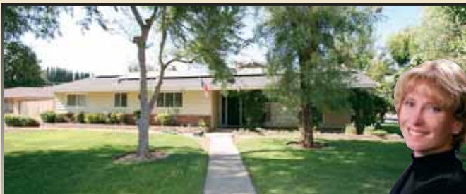
$35 ELECTRIC BILL? $388,800

4BR, 3.5BA in Fresno's premier NW neighborhood near Fig Garden Village. 13,500± sq.ft. lot gives privacy & room for friends. Quaint front porch, grand room w/fireplace, open kitchen is remodeled for gourmet cooks. Pool, spa, patio, & grassy area for entertaining. Solar power for low bills! Presented by Nikki Thomas