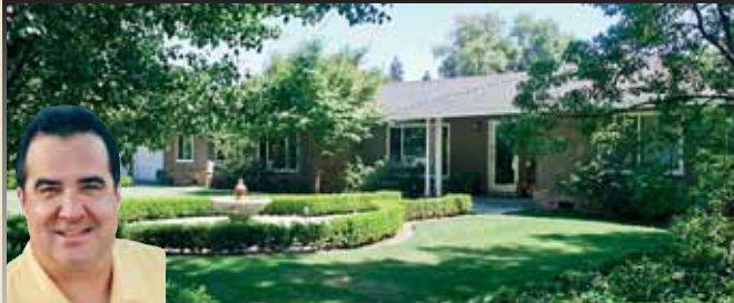
HUGE LOT ON QUIET STREET IN OLD FIG $449,000

Exquisite remodel on this 3BR, 2.5BA, 2682± sq.ft. with charm of old, & updates of new. Great room has remote-controlled fireplace. Kitchen has breakfast nook, gas stove & walk-in pantry. Office, surround sound, whole house fan, & attic fans on thermostat. 3-year-old pool, gas fire pit. Presented by John Carey, Jr.